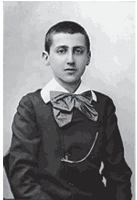
Fig. 3. Proust as a child shortly after he developed asthma.