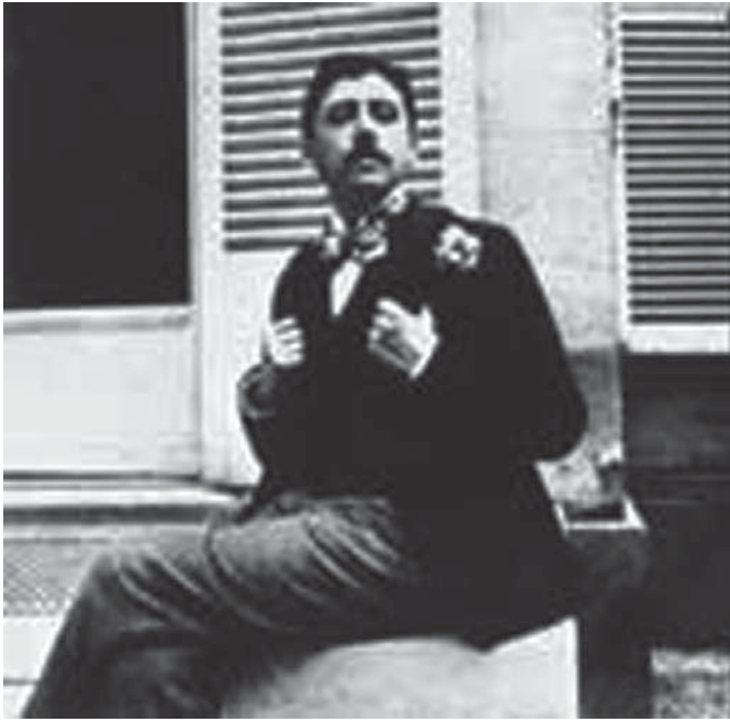
Fig. 1. Marcel Proust (1871–1922).