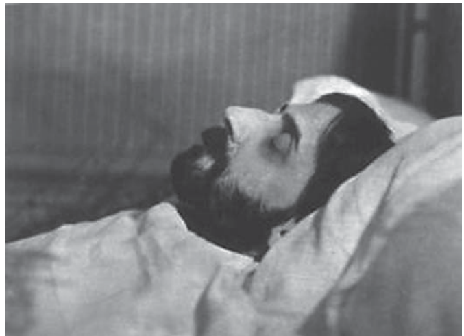
Fig. 5. Proust on his death bed, November 18, 1922, a few hours after Babinski left him.