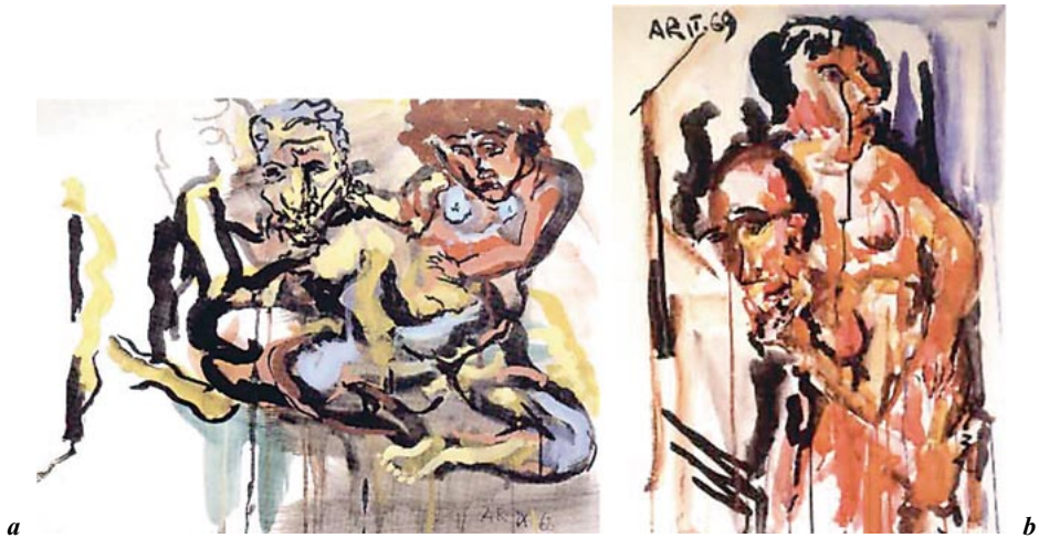
Fig. 1 a, b. Anton Räderscheidt's poststroke paintings display ecstatic scenes, often depicting couples in close personal contact. Persons are grossly deformed, the artist using brighter colors and a larger variety of colors compared to his prestroke art. A moderate left-sided hemineglect can be noted (copyright VG Bild-Kunst, Bonn, 2007).